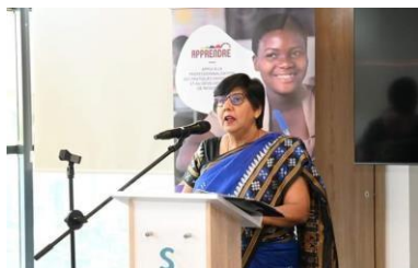
Launching of the APPRENDRE programme by the Hon VPM and Minister of Education, Tertiary Education, Science & Technology

APPRENDRE - ‘Appui à la professionnalisation des pratiques enseignantes et au développement de ressources’, a programme designed to strengthen the professional development of teachers, vital in enhancing quality of teaching, is being implemented since 2018 in French-speaking African countries including Mauritius. During her speech at the launch of the programme in April 2023 the Hon VPM and Minister of Education, Tertiary Education, Science and Technology highlighted that the APPRENDRE programme is in line with Government’s determination to put in place concrete actions for a stronger education system based on inclusion and quality. The programme will consolidate the existing platform for teachers to collaborate, share experiences, update their knowledge and engage in school-based research on pedagogical practices.