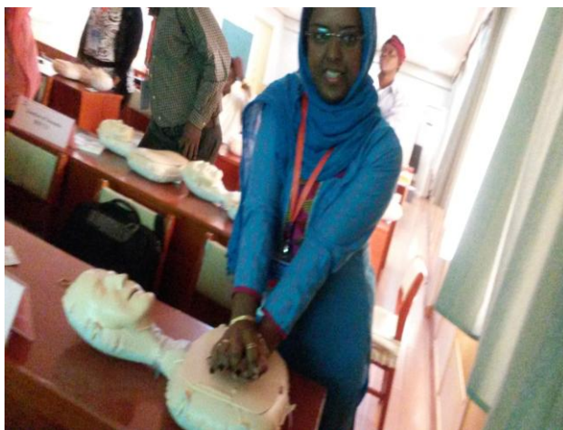
3. First Aid Practical Session-AIBO