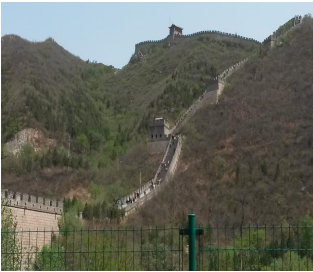
4. The Great Wall of China