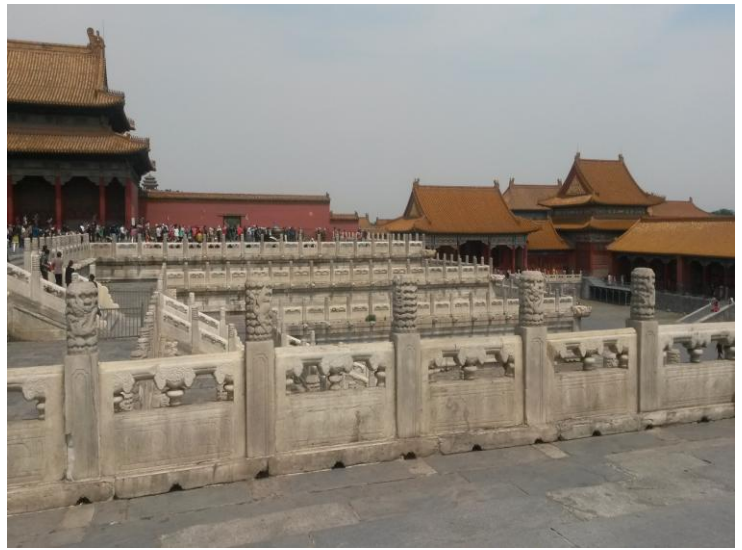
5. The Forbidden City