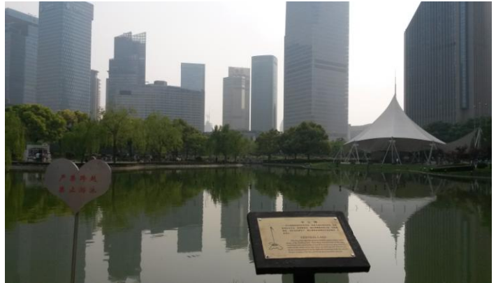
7. The Central Lake -Shanghai